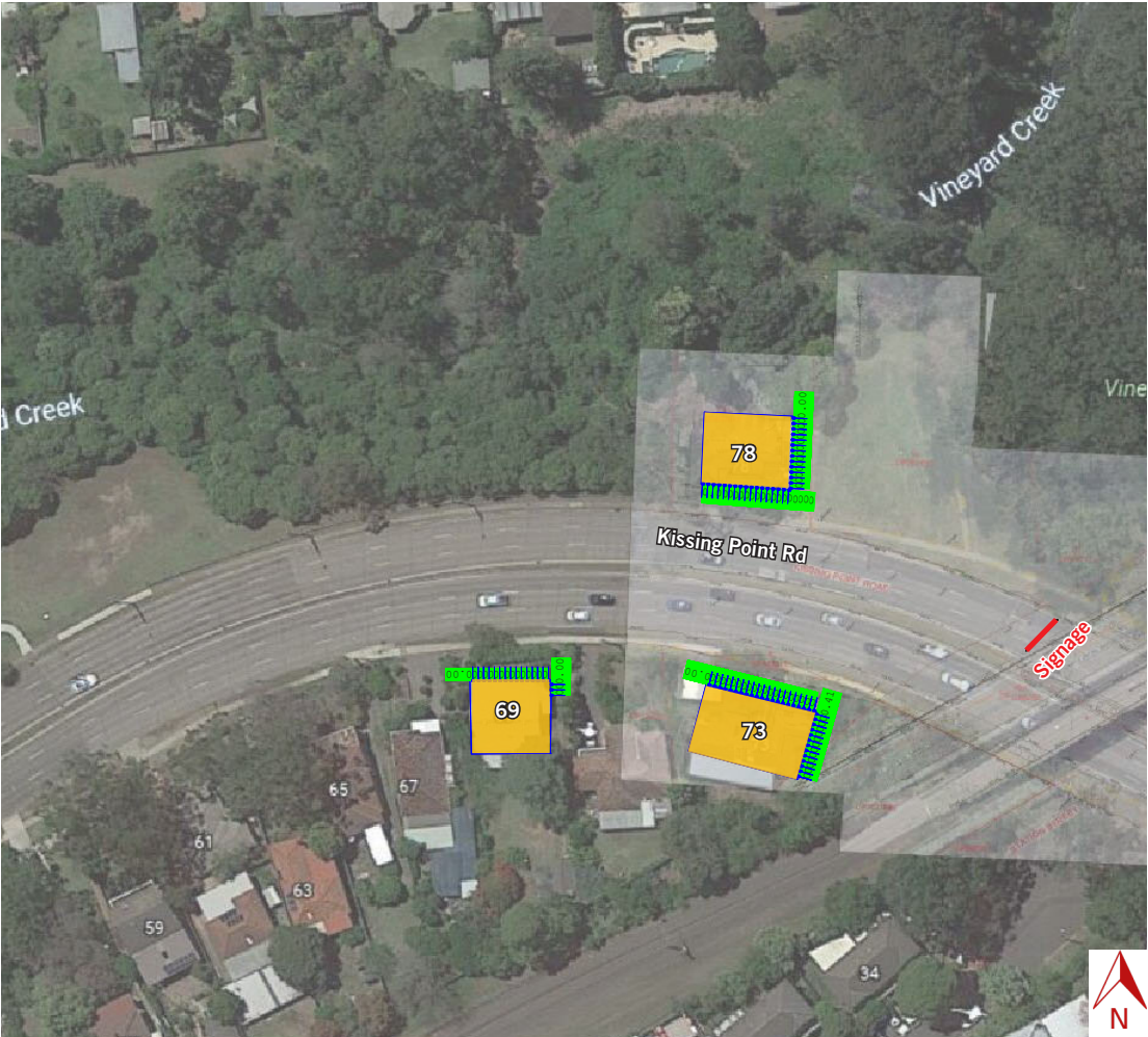
Environmental Zone Legend: